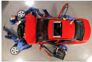
Hector Prado, Technician

We have inspected your vehicle with the following results: