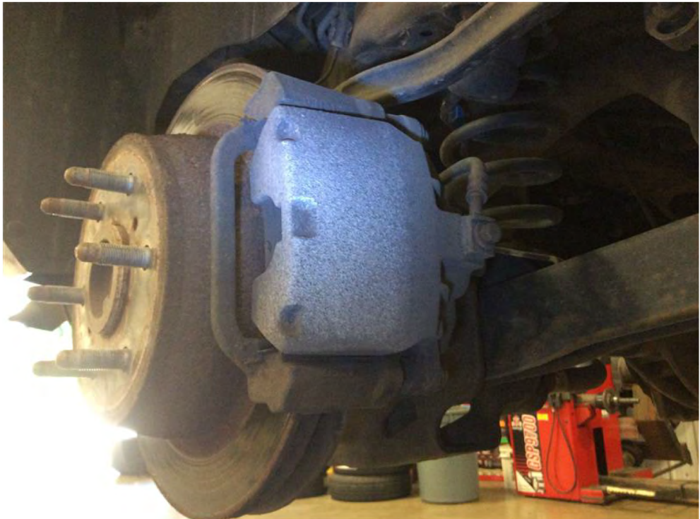
Rear Brake Calipers